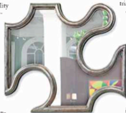
KimptonStyle Puzzle Mirror

Loews Hotels ( www.loewsathome.com ) offers unique serving ware like a dimpled martini glass set (pitcher with four glasses, $44), triangle plates (set of five, $49) and a three-tier stand ($170).